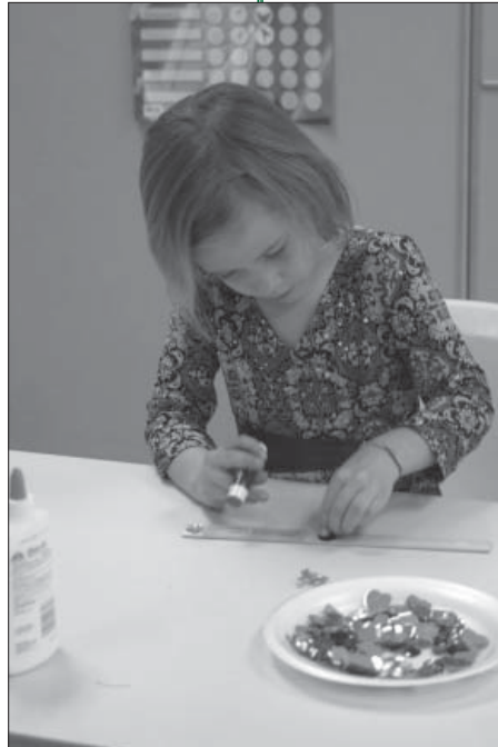
Young lady works on a craft project at Vacation Bible School.