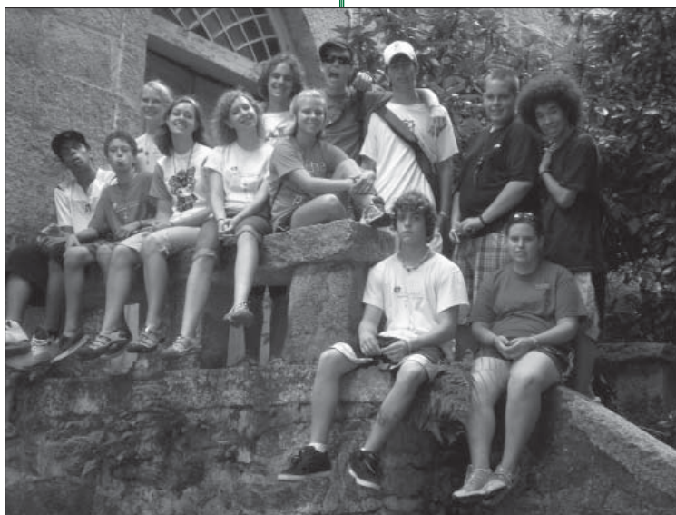
Augustana Youth on the steps of the old Lutheran Mission Church outside of Xinyang.