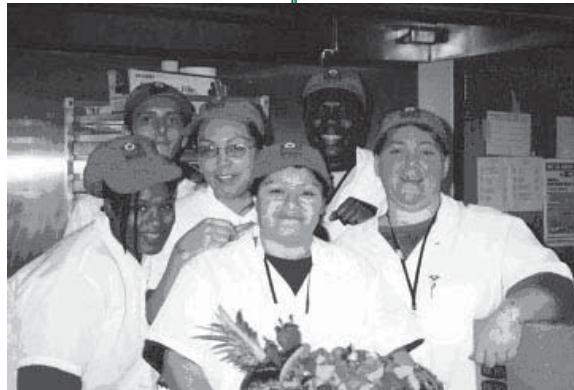
Participants in Work Options for Women

The people at Augustana are also personally involved in many community organizations through our