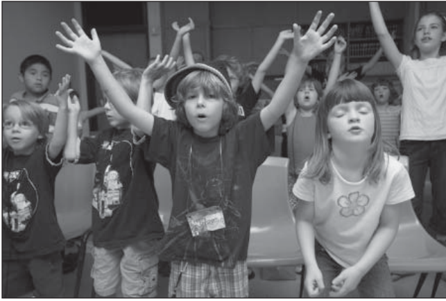
Vacation Bible School 2009