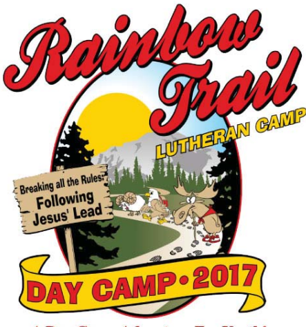
A Day Camp Adventure For Youth

This summer we have over 30 youth who will be participating in faith filled activities outside of the church. This includes the mission trip to Tennessee, Confirmation Camp, Junior Camp, Senior High Camp, and Junior High Camp. We remember them in our prayers and give thanks for the way the Spirit moves in all places. When you see them this summer, remember to ask them what they have been up to!