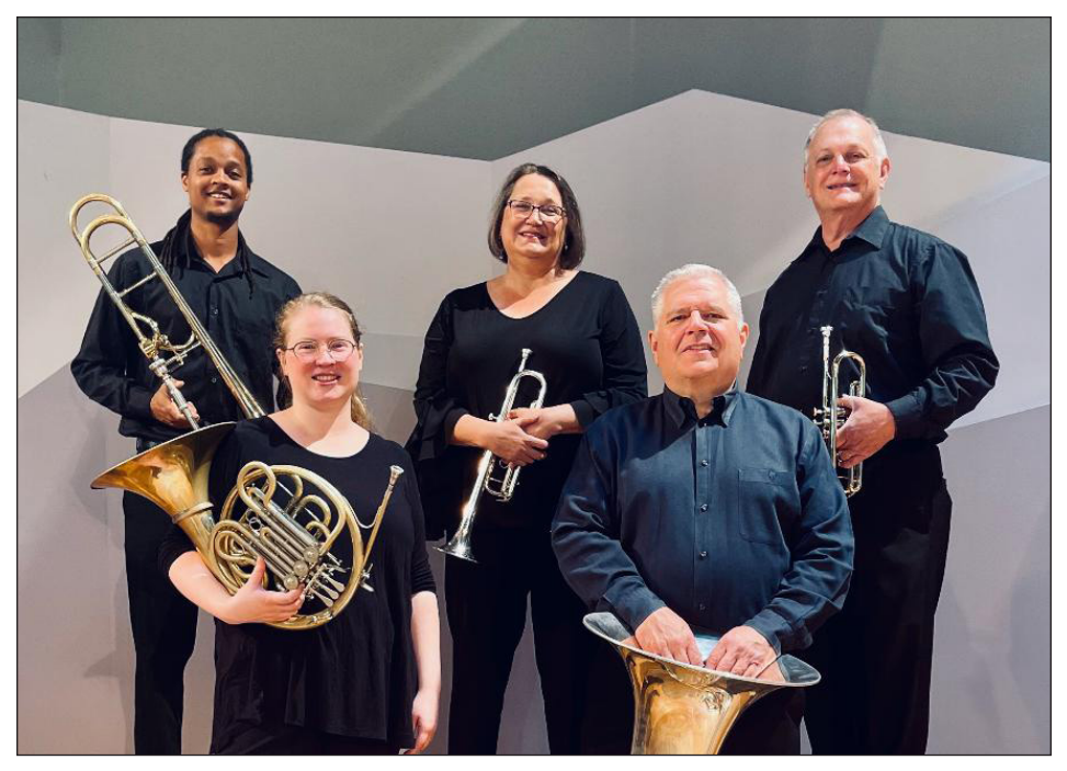
The Classical Brass