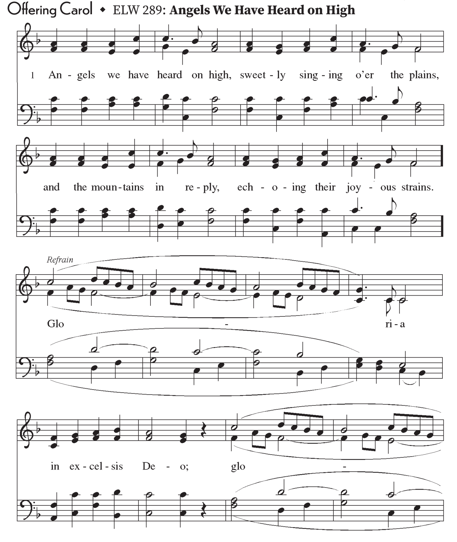
The assembly stands.