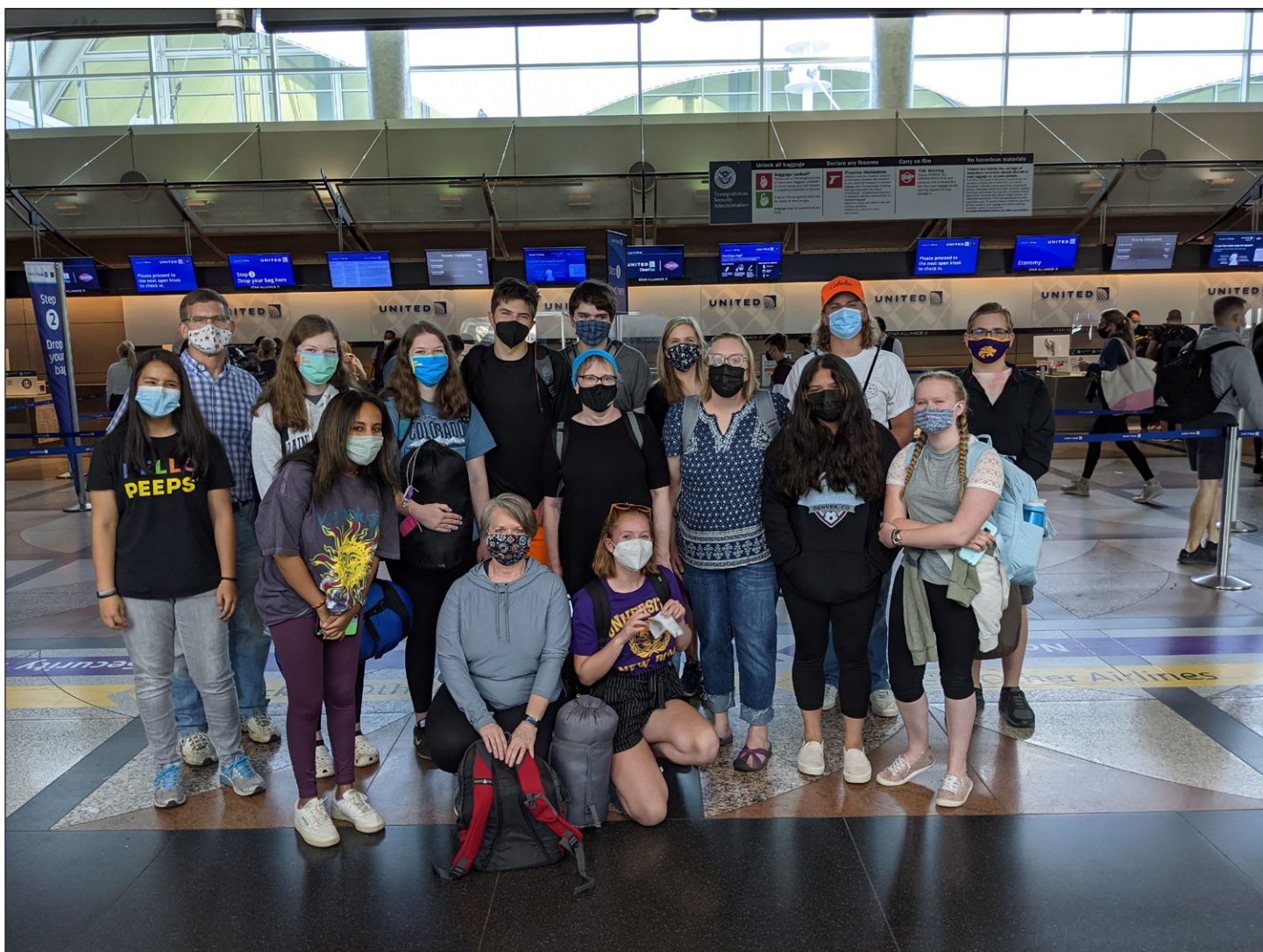
Appalacia Service Project participants