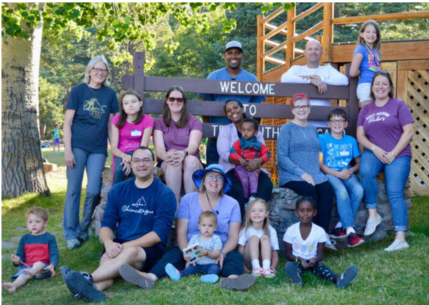
Three generations of Augustana families recently enjoyed Family Camp at Rainbow Trail.