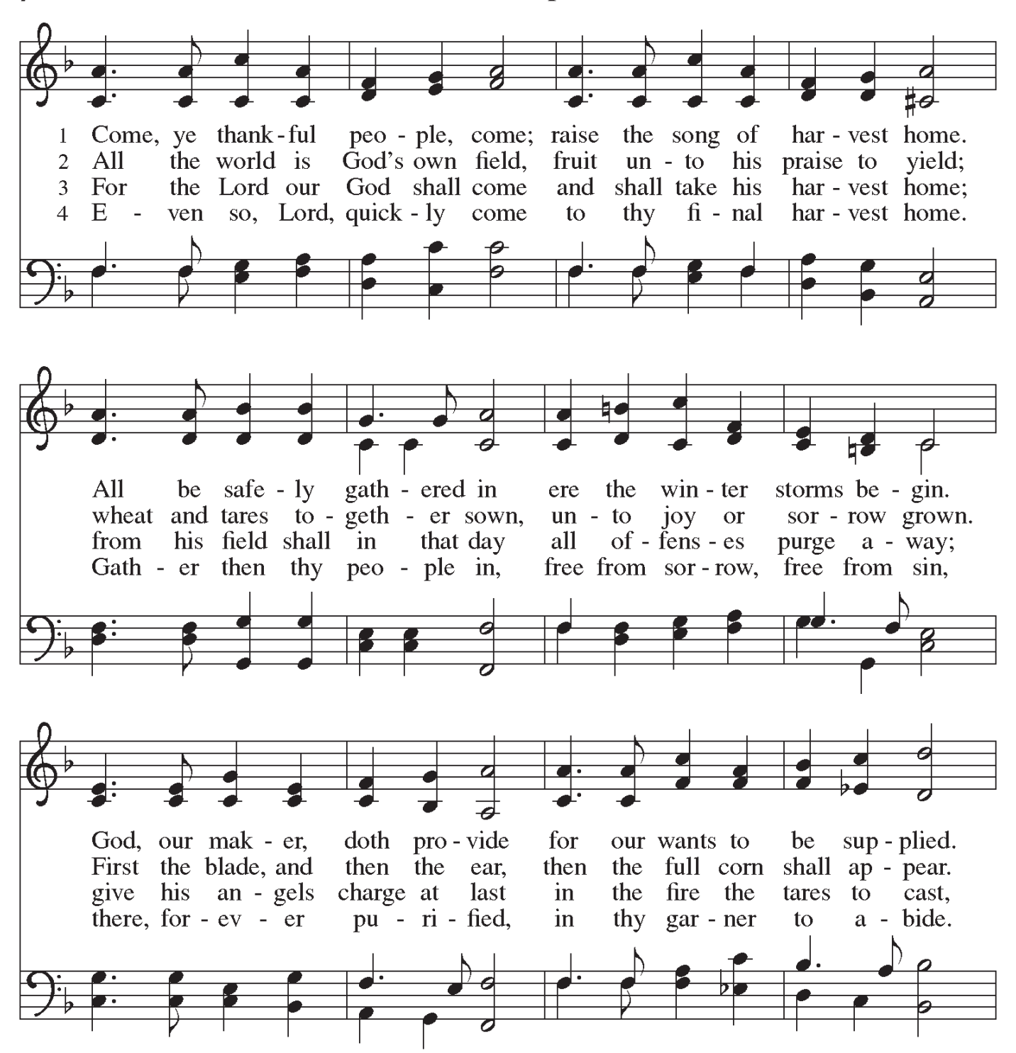
Hymn • ELW 693: Come, Ye Thankful People, Come