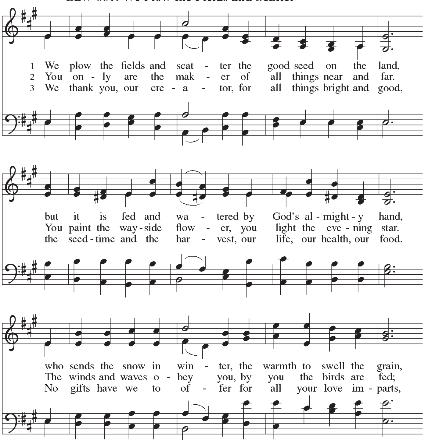
ELW 681: We Plow the Fields and Scatter