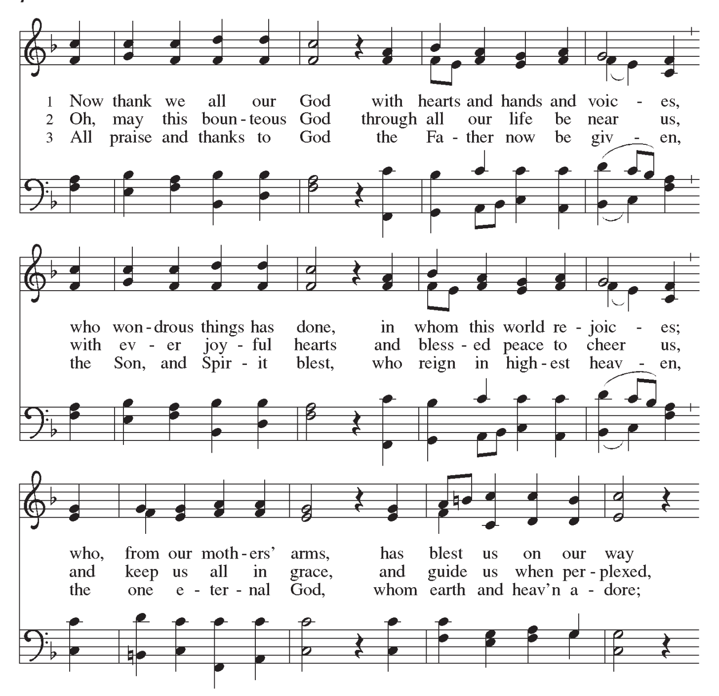
Hymn • ELW 840: Now Thank We All Our God