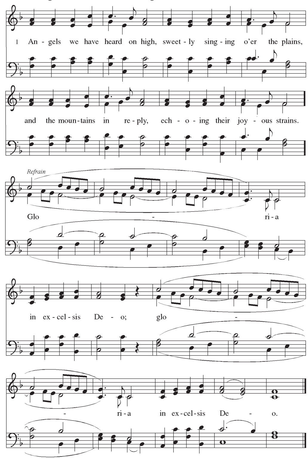
ELW 289: Angels We Have Heard on High