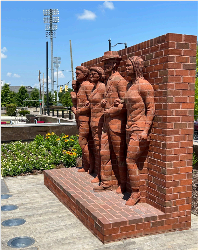
Sculpture at the Legacy Museum