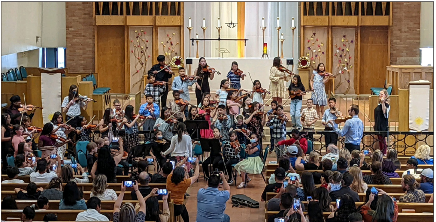
Music Encounters Recital, April 29

Mark your calendars and visit augustanaarts.org for more details!