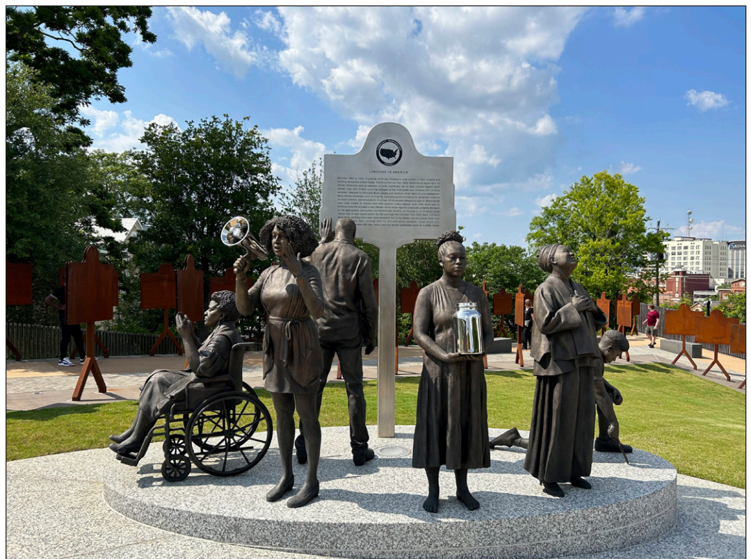
Sculpture at Memorial for Peace and Justice. People who modeled for this art were relatives of those killed by lynching.