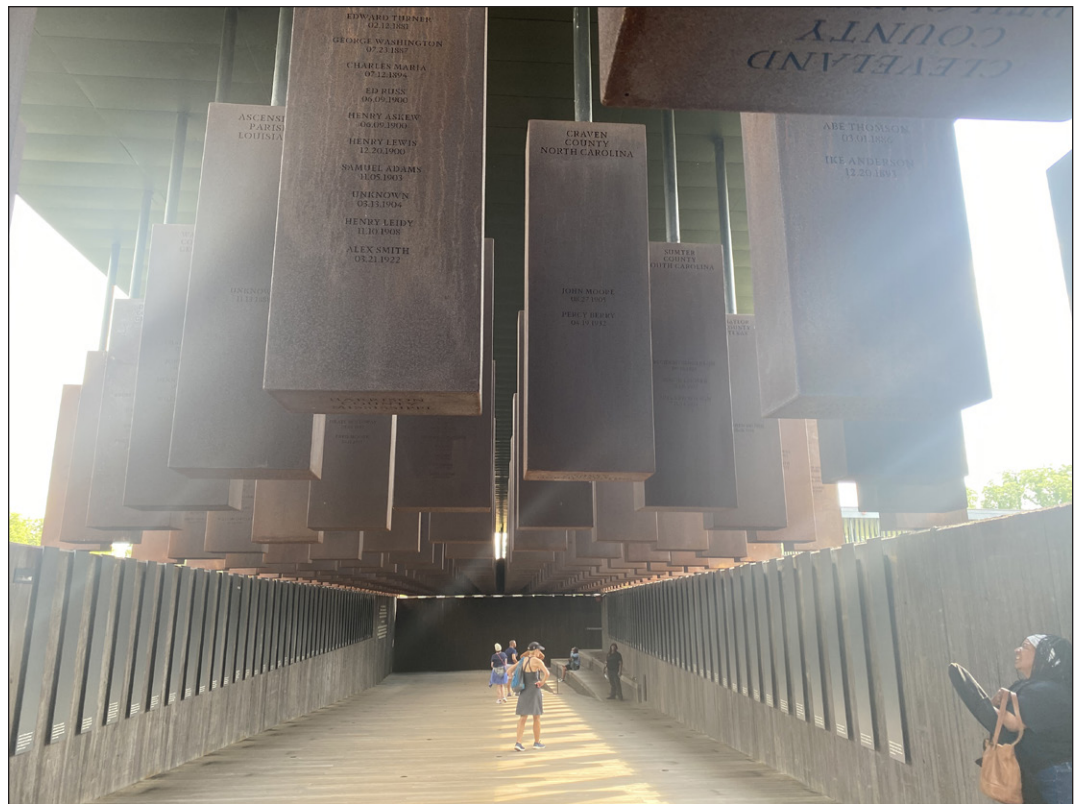
Members of the group at the Memorial for Peace and Justice