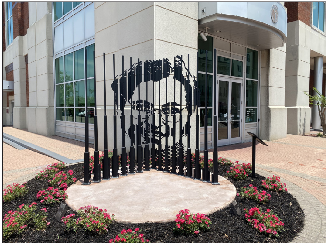
Rosa Parks Museum