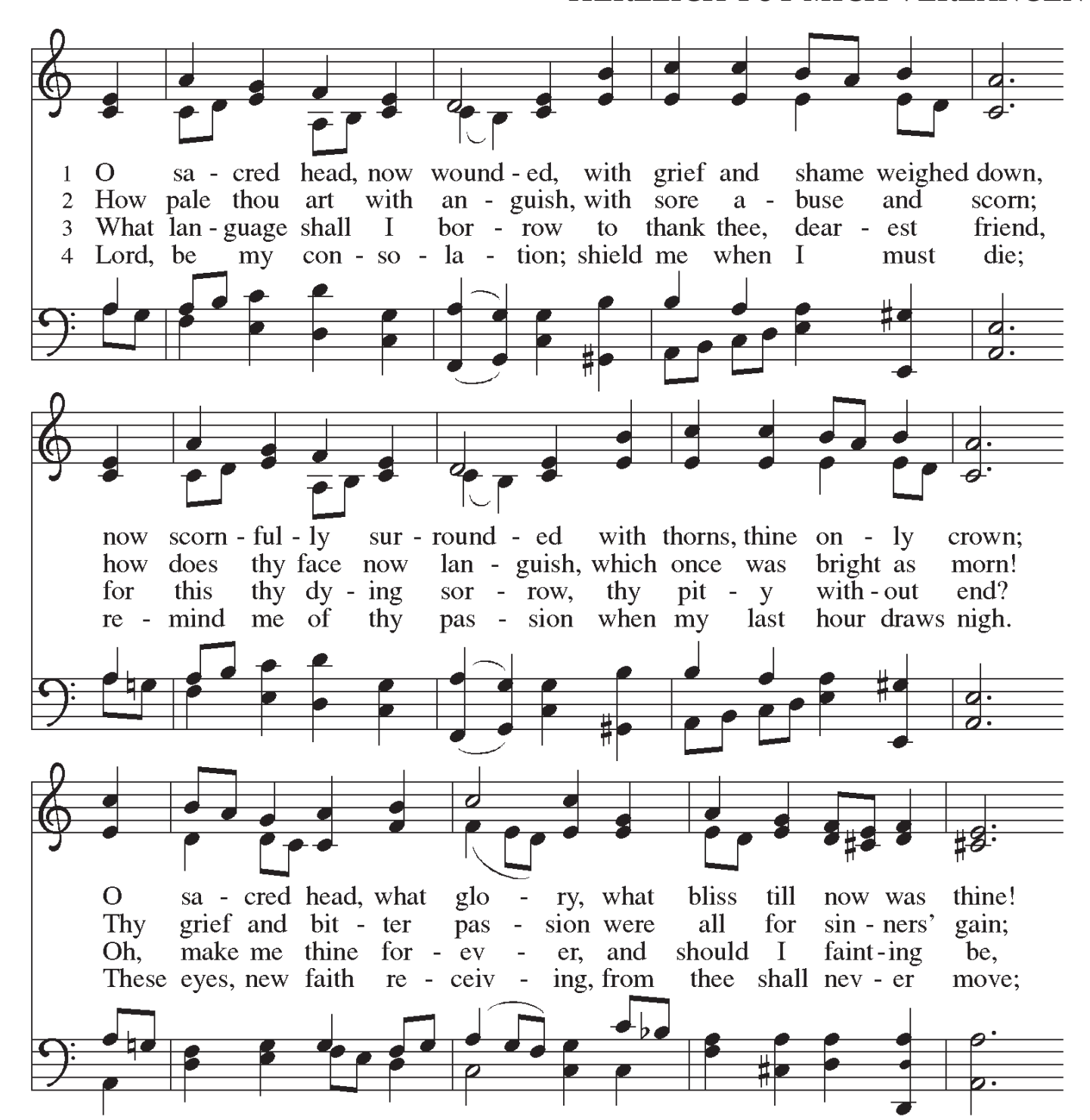
Hymn ★ ELW 351: O Sacred Head, Now Wounded HERZLICH TUT MICH VERLANGEN