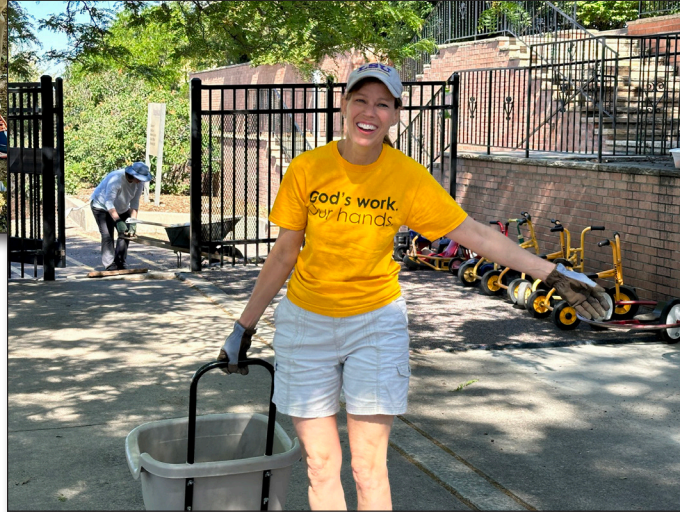
Outdoor Workday Volunteers